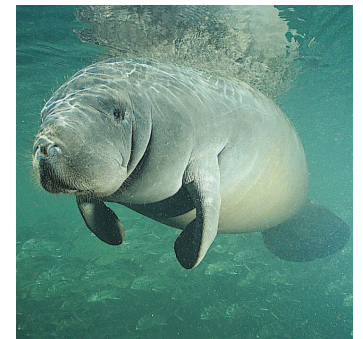
Top Paddling Phillippi Creek is a popular pastime for area residents. Above Phillippi Creek sparkles with wildlife including otters, snook, osprey and manatees.